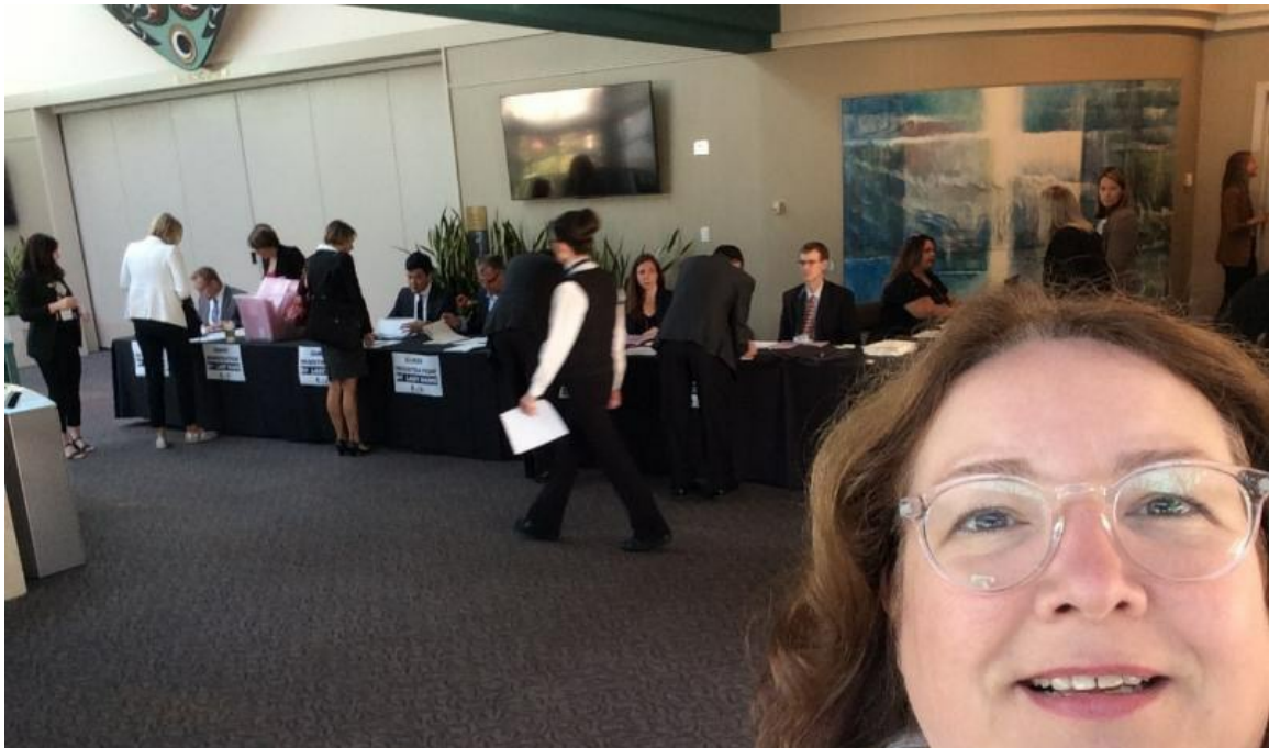
Although I continue to be challenged with taking selfies, here I am getting ready to enter the Pre-Budget Lock Up.

The provincial government announced its update to the 2017 Budget this past Monday and ASPECT had the opportunity to participate in the Pre-Budget Lock Up. For those of you who may not know, this is the opportunity for the press and stakeholders to get "locked up" in advance of the official Budget release to read the Budget documents, ask questions of government staff, prepare media releases, and conduct media interviews.